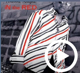
In the RED