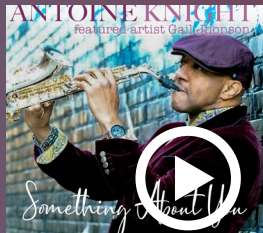
Something About You