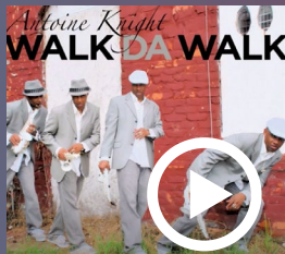
Walk Da Walk